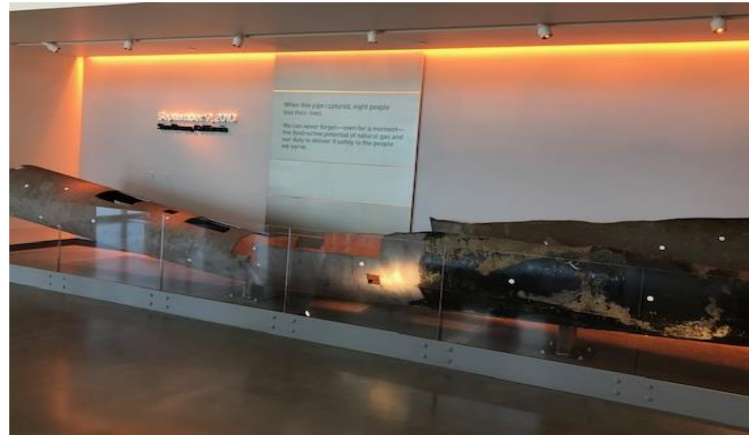
September 9, 2010 San Bruno, CA

“When this pipe ruptured, eight people lost their lives. We can never forget—even for a moment—the destructive potential of natural gas and our duty to deliver it safely to the people we serve”